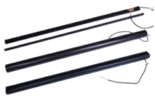
ASO Edge Sensors