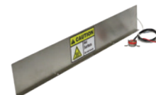
HD25/30 Heater Kit