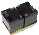
Battery Backup Kit - 50 Ah