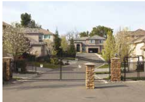
Small, Gated Cul-de-Sacs