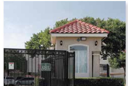
Backup Access at Gate House