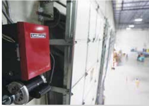
Commercial Door Operators

Use alone or with Universal Receiver (850LM/860LM) for expanded functionality