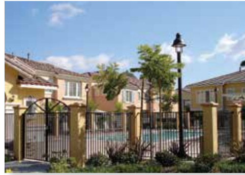
Community Pool Gates Requires Universal Receiver