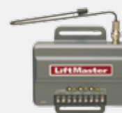
Universal Receiver (850LM/860LM)

64 in. in-ground mount pedestal, 2 x 2 in. square pipe with a black powder-coated finish, 11-gauge steel.